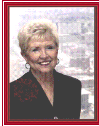
The Honorable Kay Barnes, former Mayor of Kansas City, Missouri